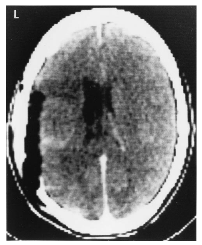
2 CT scan of the brain at time of aphasia 3 days after omental transposition. Note decreased density in middle cerebral artery territory and enlargement of left lateral ventricle from loss of brain parenchyma. Omentum seen as black area under craniotomy site with no pressure effect on brain.