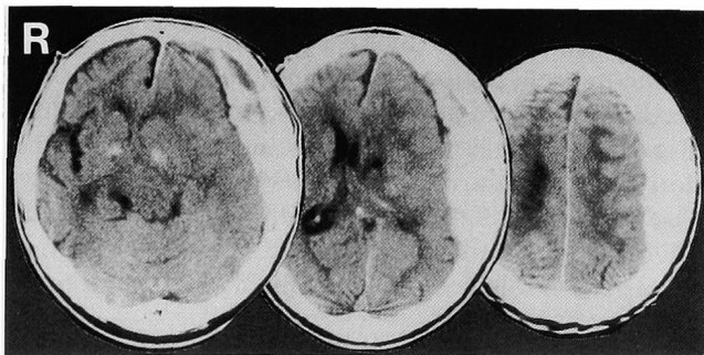
Fig. 3 Emergent computed tomography scans 33 hours after the accident showing a typical acute subdural hematoma with brain herniation.

complained of severe headache and vomited just after sitting up to get into a wheelchair. Neurological examination revealed dilatation of the left pupil. Immediate CT showed a typical ASDH (Fig. 3) which was confirmed by emergent decompressive craniectomy and hematoma evacuation. Multiple bleeding points from the cortical artery and bridging vein were seen but no AEDH. Expansion of the brain was poor even after hematoma removal. He did not recover well postoperatively and died of pneumonia one month later.