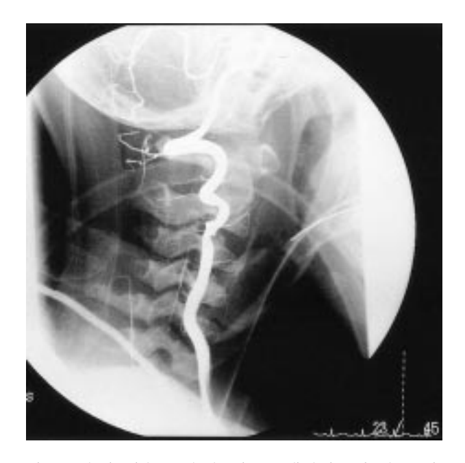
Fig. 2. Selective right vertebral angiogram disclosing a focal stenosis with indentation of the arterial wall at the upper limit of the C3 vertebral level