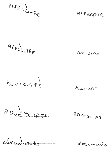
Fig. 2 Samples of patient's writing errors (arrows)

The patient's deficit was similar to that described previously [10] in a patient who had cerebellar atrophy. Despite different cerebellar pathology (atrophic and diffuse versus vas-