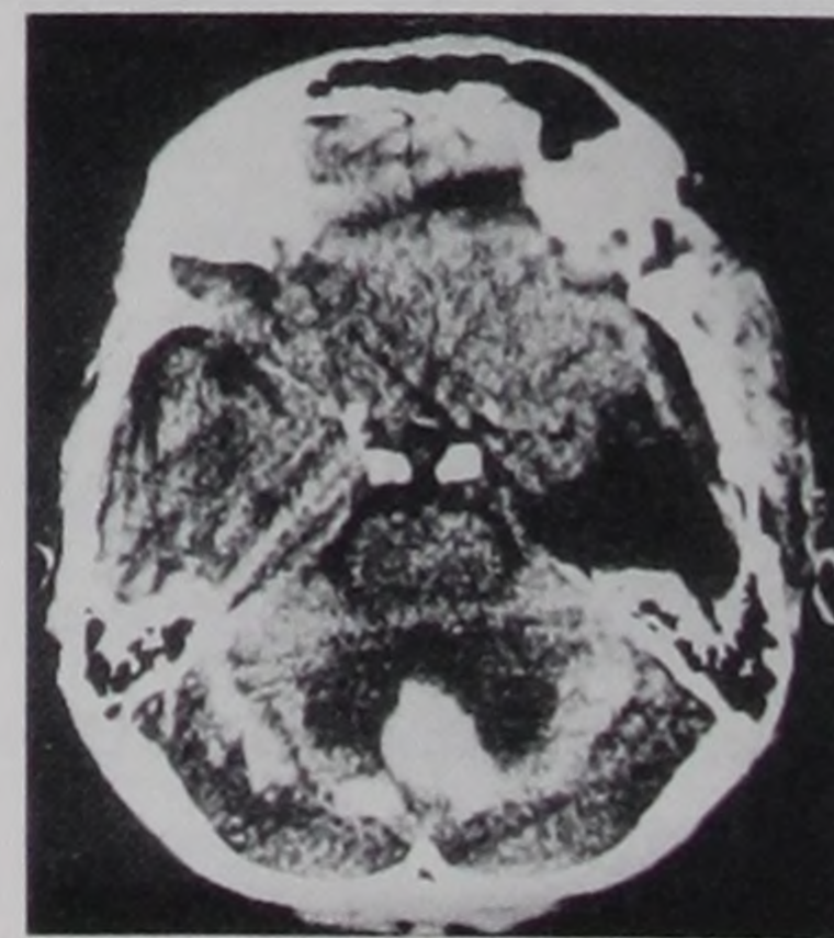
FIGURE 1. Patient 1. Extensive hemorrhage involving the vermis and both cerebellar hemispheres was demonstrated

The patient did not awaken from anesthesia in the immediate postoperative period and exhibited decerebrate posturing. Postoperative blood pressure and coagulation test results were normal. Computed tomographic scans obtained 6 hours after surgery showed hemorrhage involving the vermis and both cerebellar hemispheres (Fig. 1). The