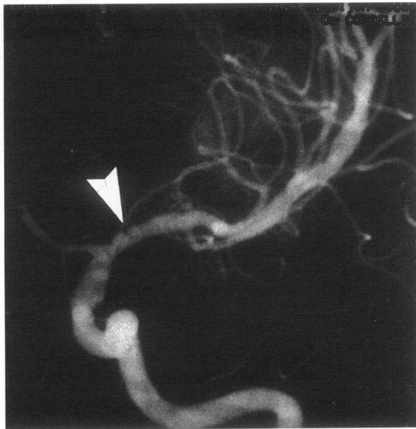
Fig. 1. Selective left internal carotid artery injection with digital subtraction, antero-posterior view: fibromuscular dysplasia and irregular narrowing (arrow).

vertebral arteries performed 48 hours later revealed an elongated irregular narrowed segment of the left sylvian artery with signs of fibromuscular dysplasia of both the left and right intracranial internal carotid arteries (Fig. 1). There were no sites of fibromuscular dysplasia in the renal or cervical arteries. Doppler ultrasound did not reveal any thick media, eliminating Takayasu disease, and an arteriogram did not reveal any cerebral collaterals of Moya-Moya type. Inflammatory tests were normal and anti-nuclear antibodies were negative.