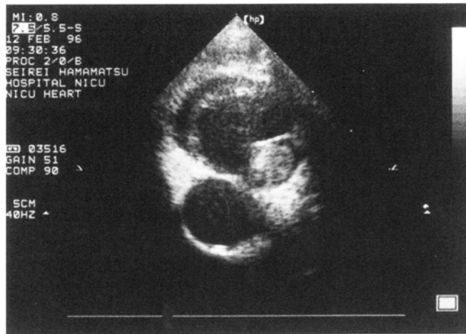
Fig. 1. Two dimensional echocardiography in short axis view showed a large thrombus within the remnant main pulmonary artery. The thrombus appeared to float within the stump.