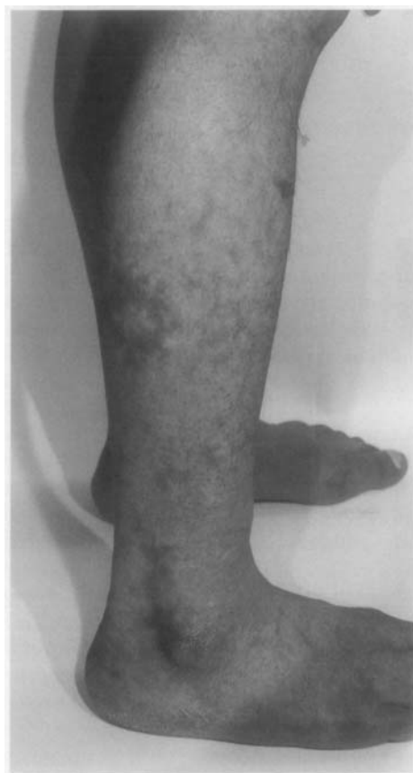
Fig. 1. Reticular erythema on the lower extremities.

A 31-year-old woman who had epileptic seizures and unconsciousness was admitted to the emergency service. Neurologic examination revealed unconsciousness and right hemiplegia. Dermatologic examination revealed reticular