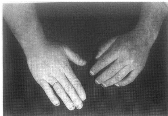
Fig. 3. Reticular erythema on the upper extremities

trasonography, and posteroanterior chest X-ray graphy were normal. CT demonstrated acute infarcts of the areas supplied by the middle cerebral arteries (Fig. 4). Anticardiolipin antibodies, protein C, and protein S were in their normal ranges. ATIII was 60 mg/dl (normal range: 22–39 mg/dl).