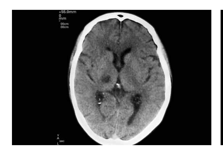
Fig. 1. Cranial CT showing an infarction in the right thalamus having an effect on the internal capsule.

Thalamic infarcts cause several types of tremor, whether rest, or postural tremors. However, some patients may display both types of tremors simultaneously. The frequency of these tremors varies from 8 to 12 Hz, persists, and is intensified during movement and in states