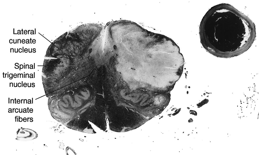
Figure. Right lateral medullary infarct at level of sensory decussation including gracilis, cuneate and lateral cuneate nuclei, and internal arcuate fibers of the sensory decussation (luxol fast blue, H-E).

We believe the slightly more caudal location with involvement of the cuneate and lateral cuneate nuclei, the crossing fibers of the sensory decussation, and the spinocerebellar pathways give an