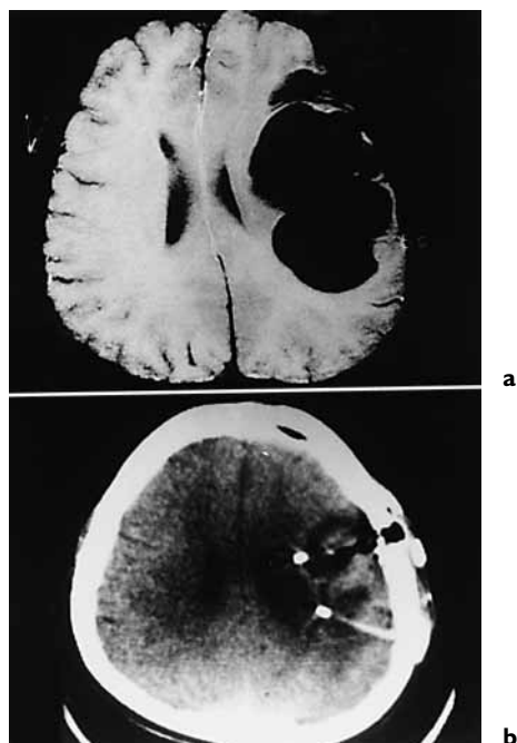
Fig. 3. a MRI showed an enlarged huge cyst. b Two Ommaya reservoirs inserted in the cyst.

intracerebral hematoma. GKRS was performed for a residual AVM, the diameter of which was 20 mm. The maximum dose was 34 Gy and the margin dose was 16 Gy. At 15 months after the treatment, the AVM had completely disappeared. However, about 3 years later, the patient developed a headache and MRI showed a large cyst in the irradiated region. A biopsy was taken and a cystoperitoneal shunt was inserted. Histological examination showed gliosis. The other case reported by this group concerned an 11-year-old boy. Ventricular drainage had been performed following a left thalamic and intraventricular hemorrhage. The diameter of the nidus was 23 mm. At GKRS, the maximum dose was 44.5 Gy and the margin dose was 20 Gy. After 24 months the AVM was obliterated. About 1 year later, the patient developed a headache and a tremor in his right hand. The MRI showed a large cyst. A biopsy was taken and an Ommaya reservoir was inserted. Histological examination showed gliosis.