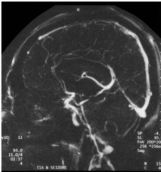
Fig. 3. Follow-up magnetic resonance venogram shows recanalization of the superior sagittal sinus.

nase was withdrawn from the consolidation regimen. Follow-up free protein S level 1 month after the stroke onset was 70%. At 2 years, he continued to be well.