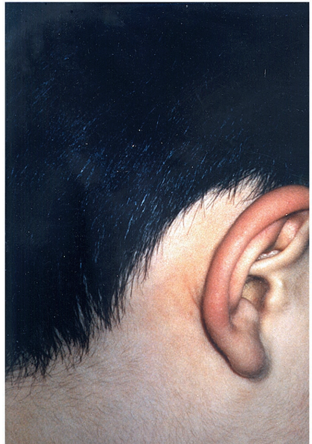
Figure 2 Right ear helix showed redness accompanied with mild burning and local heat.