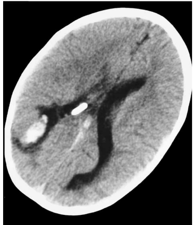
Fig. 1. An axial CT scan of the patient's brain illustrates the ventricular catheter of the shunt projecting into an effaced right lateral ventricle. Related to the entry point of the catheter is a hyperdense white lesion indicating a recent intracerebral haematoma with surrounding low density oedema.

He then became drowsy and lethargic and shortly afterwards had a witnessed left-sided focal convulsion lasting 5 minutes. He was therefore transferred to the regional neurosurgical unit with suspected shunt malfunction or infection. Examination did not reveal any cause for his deterioration but the attending neurosurgeon noted that the shunt system did not have a reservoir. A cranial CT scan was then performed which demonstrated normal sized ventricles and an intraparenchymal haemorrhage beneath the burrhole, alongside the ventricular catheter (Fig. 1). It was concluded that in attempting to access the shunt, the right angled connector, situated over the burrhole, had been mistaken for the reservoir of a shunt system (Fig. 2). This right-angled connector was dome shaped and on palpation could easily have been mistaken for a burrhole type shunt valve. This had resulted in the haemorrhage which later, presumably due to the surrounding swelling visible on the scan or an unwitnessed or subclinical seizure, precipitated his depressed level of consciousness and the second observed seizure. The patient was managed conservatively and discharged after 4 days observation having