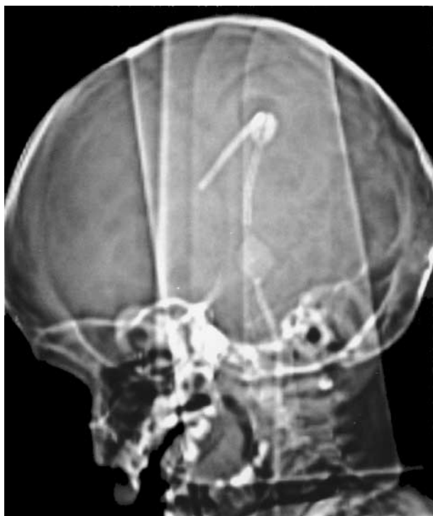
Fig. 2. The lateral CT survey view of the patient's head demonstrates how easy it can be to mistake the right angled connector of the shunt, illustrated in Fig. 3, for the shunt alongside to the right, with a reservoir situated over the burrhole.

burrhole. They can be accessed by passing a 23G or 25G butterfly needle through the overlying skin and through the silastic dome, so that the bevel of the needle lies within the reservoir. Free flow of CSF indicates patency of the ventricular catheter. The tubing can then be connected to a manometer in order to measure the pressure within the ventricular system. If the reservoir is situated caudal to the valve, elevating the manometer above the shunt valve opening pressure should result in flow of CSF from the manometer back into the shunt system, indicating patency of the distal catheter. Abnormal findings in shunt fluid dynamics, with and without infusion studies can thus help in identifying the site of obstruction to which neurosurgical attention can then be directed at the time of revision. 5,8 An alternate method of assessing CSF dynamics and patency of the shunt system is to inject a contrast medium into the antechamber of the shunt system; X-rays of the skull, chest and abdomen taken 10 minutes after administration will demonstrate if the catheters are patent and if there is free CSF flow from the ventricles towards the peritoneal cavity. Meticulous aseptic technique is essential when performing these procedures and prophylactic antibiotics are sometimes administered. 9