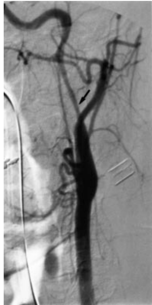
Figure 2 Oblique view of the patient's left internal carotid arteriogram shows a dissection.

Department of Anaesthesia and Intensive Care, Prince of Wales Hospital, The Chinese University of Hong Kong Faculty of Medicine, Hong Kong A M-H Ho