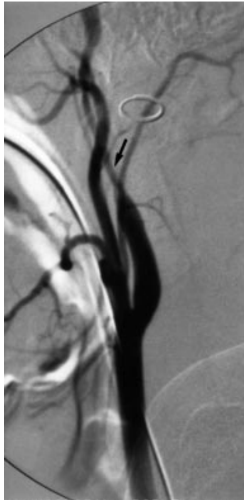
Figure 1 Lateral view of the patient's right internal carotid arteriogram using digital subtraction techniques shows a dissection.

At the hospital, he was found to have normal vital signs, a closed fracture of the left humerus, right hemiplegia with no other neurological deficit, and normal computed tomography of the head. Digital subtraction left internal carotid arteriogram was immediately carried out.