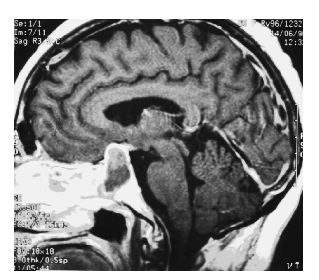
FIG. 2. Gadolinium-enhanced MRI showing pituitary tumour enhancing peripherally with contrast, with inferior hypodensity suggestive of tumour necrosis.

Pituitary apoplexy occurs in approximately 2% of patients with pituitary tumours, 1,2 because of haemorrhagic infarction or necrosis of the tumour. The diagnosis of the condition can be difficult and is often delayed, as in our case, because in addition to its relative rarity, the presenting symptoms and signs can suggest more common conditions and the existence of an adenoma is usually unsuspected at the time of the ictus.<sup>3</sup> The features of the syndrome include headache of acute onset, vomiting, meningism, visual impairment, ophthalmoplegia and deterioration in the level of consciousness<sup>2</sup> Alteration in the level of consciousness, attributed to such diverse causes as brain-stem or hypothalamic dysfunction, vasospasm and metabolic derangement is not uncommon.<sup>3,4</sup> However, its occurrence because of