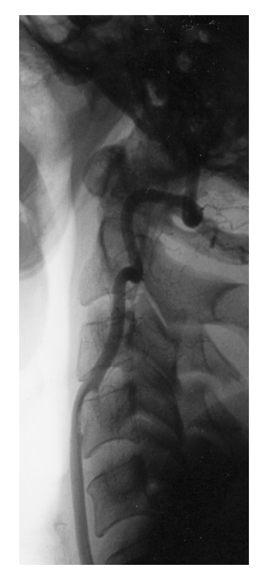
Figure 3. Lateral view of a conventional left vertebral arteriogram showing left vertebral artery compression at the C4 vertebral as the artery courses posteriorly to enter the transverse foramen of C3.

After 24 hours, all symptoms resolved. However, on the subsequent day the woman experienced right-side neck pain, right upper extremity weakness, gait ataxia, speech dysrhythmia, and transient headache. On the third day, she again was evaluated neurologically. She was normotensive with mild cervical paraspinal muscular tenderness without meningismus. Her speech was mildly hesitant, but she had normal volume and no dysarthria. Her cranial nerves were intact without a Horner's syndrome, and her reflexes were increased slightly in the right arm. She demonstrated mildly clumsy, irregular, rapid alternating movements in both upper extremities, more on the right, and had difficulty with tandem walk. An arteriogram showed that the left vertebral artery coursed anteriorly along the spine to the C4 vertebral body, where the vessel then passed posteriorly to enter the C3 transverse foramen (Figure 3). At C4, there was a focal area of internal dissection with intimal irregularity and less than 50% stenosis. Provocative neck maneuvers, including flexion, extension, rotation, and arm positioning, did not increase stenosis or alter the caliber of the left