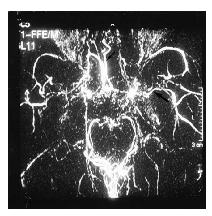
Fig. 2. Magnetic resonance cerebral angiogram demonstrating stenoses of the anterior cerebral artery (thin black arrow) and middle cerebral artery (thick black arrow) resulting in a well-developed collateral vascular system.

upper IVC 1.80 pmol/ml/h, lower IVC, 1.00 pmol/ml/h).