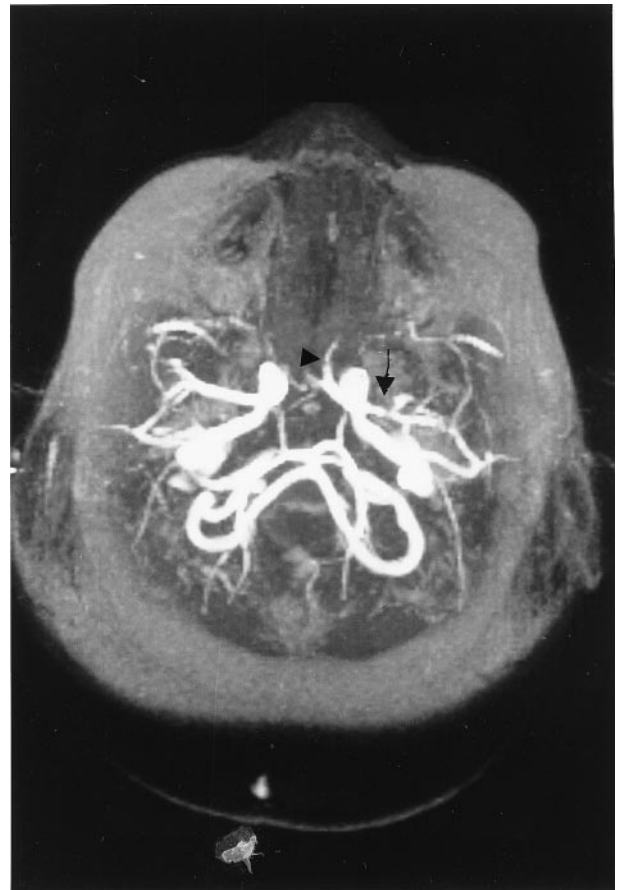
Figure 2. Magnetic resonance angiography revealing an irregularly narrow flow signal in the left proximal middle cerebral artery (arrow) with a compensatory increased flow signal in the left anterior cerebral artery (arrowhead).

left basal ganglion and peripheral areas of the left parietal lobe. Magnetic resonance imaging exhibited T_2 -weighted prolongation at the left putamen, left globus pallidus, left insular region, left frontal, and the parietal areas (Fig 1). Magnetic resonance angiography (MRA) revealed an irregularly narrow flow signal in the left proximal middle cerebral artery, indicating cerebral vasculitis (Fig 2). A transcranial Doppler study of the intracranial vessels yielded decreased blood flow in the left middle cerebral artery, compatible with segmental stenosis of the proximal middle cerebral artery.