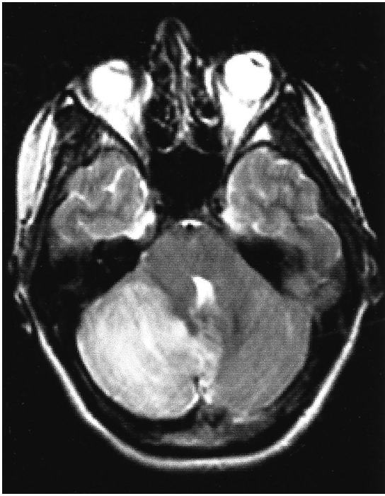
Figure 3. Case 2: T2-weighted brain MRI. Right cerebellar, hyperintense, pseudo-tumoral lesion producing mass effect on the fourth ventricle.

gressive loss of consciousness and decerebration. Brain CT revealed increased hydrocephalus. She underwent drain repositioning and suboccipital craniotomy for posterior decompression and cerebellar biopsy. On pathology, the most striking abnormality was a dense, perivascular and transmural, inflammatory infiltrate affecting small arteries and venules. The infiltrate consisted predominantly of T lymphocytes, as well as many eosinophils and a few neutrophils. There was no evidence of granulomatous angiitis or fibrinoid necrosis. Leptomeningeal vessels were more affected than those of the cerebellar cortex and white matter. The small amount of necrotic and hemorrhagic cerebellar tissue indicated some acute damage, but the marked Purkinje cell loss, Bergmann gliosis, and gliosis of the white matter implied a more chronic process. There were no intraparenchymal granulomas, viral inclusions, microglial nodules, or evidence of a parasitic infection. Tissue stains and cultures disclosed no infection. Electron microscopy showed endothelial cell necrosis in some vessels and transmural inflammatory infiltrate indicating vasculitis. There were no viral inclusions, tubuloreticular inclusions, or Birbeck granules (specifically evaluated in view of the presence of eosinophils in the inflammatory infiltrate).