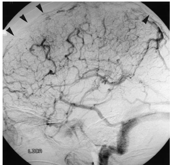
Fig 3. Lateral view of left internal carotid artery angiogram shows absent filling of the SSS (arrowheads).

His functional status improved greatly during his 6-day inpatient rehabilitation stay, and he met the goals of independence in ambulation and ADLs. By the time of discharge, the patient was ambulating 1200 feet independently with no assistive device, and able to walk up and down 18 stairs independently. His FIM™ instrument score improved 30 points over the 6 days, for a FIM efficiency score of 5.0 points gained per day of rehabilitation. Left leg numbness persisted. He was discharged on enoxaparin. The patient, however, did not take enoxaparin because of the cost. Two days later, he developed right leg pain. This progressed over the ensuing 48 hours to right then left upper quadrant abdominal pain with deep inspiration, fever, and night sweats.