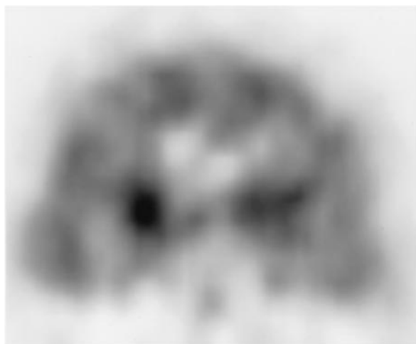
Fig 2. Coronal SPECT image of patient 2 showing asymmetric perfusion to the basal ganglia (decreased on the left).

SPECT scans in our patients showed asymmetrical blood flow in basal ganglia and thalamus without corresponding abnormalities on MR imaging. Our second patient also had reduced left-sided parietal and frontal cortical blood flow. It