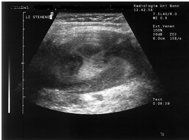
Figure 3. Duplex sonography of the left popliteal venous aneurysm with the patient in upright position. Extremely slow flow was demonstrated within the lumen of the aneurysm.