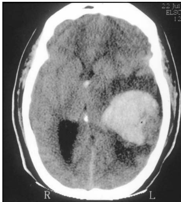
Fig 2. CT scan after neurological deterioration shows an increase in blood volume. Edema and mass effect can be seen.

Sarcomas involving the CNS can develop either in the parenchyma or in the adjacent structures or may originate in distant organs 11 . The incidence of brain sarcomas varies from 0.5% to 2.7% with an average of 1.5% in 27487 intracranial neoplasms 11,12 . The development of new treatment protocols has improved the period of survival in patients with sarcomas. The incidence of cerebral metastasis has increased, maybe as a result of more time for tumor spread.