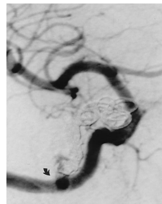
FIGURE 2. Posttreatment (GDC) right ICA angiogram, frontal projection. Only minor residual flow from the fistula into the right IPS (arrowhead) is now apparent. The GDC ball extends from the right CVS and into the right IPS.

The excellent clinical result remained unchanged at 16 months' review, whereupon, at a third admission, a right