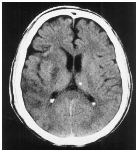
Fig. 2. A computed tomography scan of the brain showed left cerebral infarction.

Fig. 1. A parasternal long axis recording showed a free-floating ball thrombus in the left atrium. A (left): The thrombus is within the mitral orifice during diastole and appears to occlude the valve. B (right): Also recorded during systole, the thrombus is in the superior portion of the atrium.