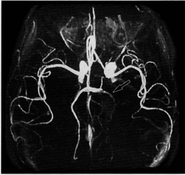
Figure 2. Magnetic resonance arteriography demonstrating almost complete occlusion of the left posterior cerebral artery near the bifurcation of the basilar artery.

should be very cautious, however, when evaluating these two cases. The failure to identify any precipitating or other risk factors for ischemic stroke in these patients does not necessarily imply the lack of their existence. The frequency of sickle cell trait is high in certain population groups (about 8% in African Americans), 8 and if this was indeed a risk factor for stroke in childhood, far more than two cases should have been reported in the literature. Consequently, the primary cause of the posterior cerebral artery infarct in our patient was thought to be the recent Mycoplasma infection. However, given the fact that the precise mechanism of neurologic complications associated with M. pneumoniae has not yet been elucidated, the possibility that the presence of Hb S (38.5%) played a role in the sequence of events triggered by the Mycoplasma infection could not be excluded.