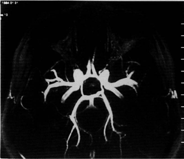
Figure 3. Magnetic resonance angiography of the case was normal.

In almost 60% of cases with hemiplegic migraine, symptoms last less than 1 hour, but there are also cases reported in whom hemisyn-drome symptoms persisted for more than 5 days. 2 Familial hemiplegic migraine has an autosomal dominant inheritance, and it has recently been reported that the gene locus was on chromosome 19. 4-6 The mother of our case had common migraine, but she did not have a family history of hemiplegic migraine.