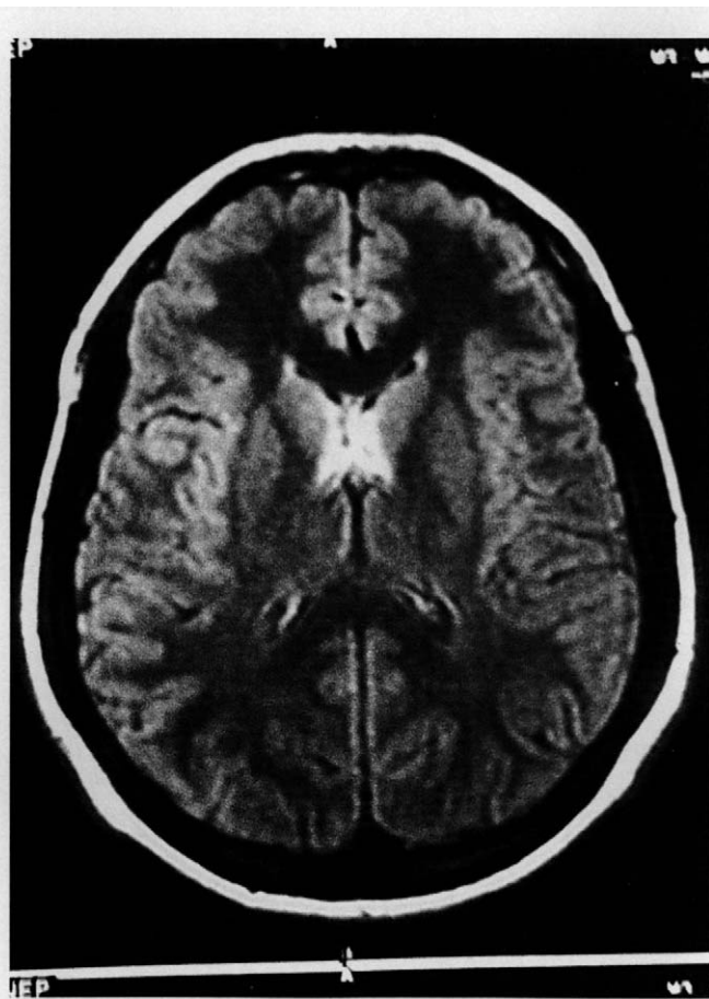
Figure 2. Axial fluid-attenuated inversion-recovery (FLAIR) image was normal on the fourth day.

Our case had left hemiplegia occurring at the same time with headache attack. Headache was localized in the occipital region.