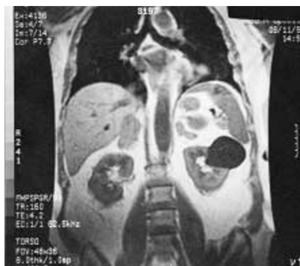
Fig.1 - MRI reporting bilateral enlargement of the adrenal glands with irregular nodular aspect.

The removed adrenal glands were enlarged, macronodular and weighted 80 and 95 g respectively, containing yellow nodules of various sizes. The tissues were fixed in buffered formalin embedded in paraffin. Sections were stained with Hematoxylin-eosin. The histological examination revealed a monotonous proliferation of large clear cells with small and uniform nuclei and an unvacuolated cytoplasm, arranged in cords or nets. Occasionally, small compact cells were mixed with the major proliferation of clear cells. Small remnants of normal cortical and medullary adrenal tissue were occasionally found (Fig. 2).