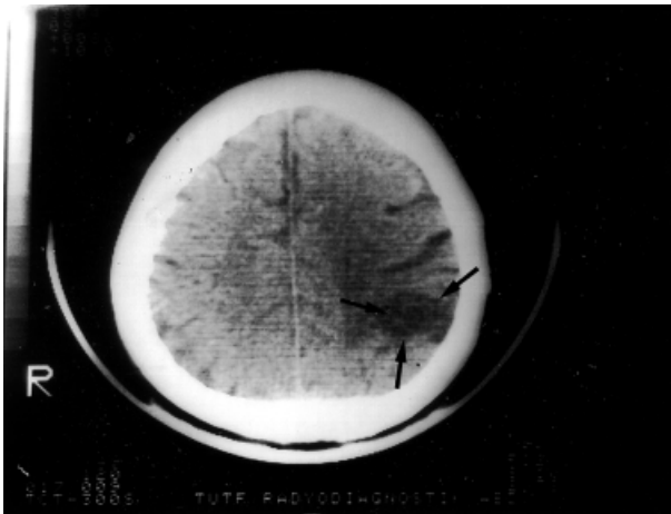
Figure 1. CT scan demonstrating hypodensity in the left parietal cortex, consistent with subacute infarction.