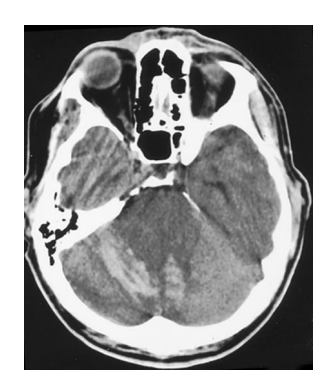
FIGURE 1. Patient 1. CT scan of the head without contrast obtained 2 days after surgery, demonstrating acute hemorrhage in the cerebellar vermis and superior aspect of the right cerebellar hemisphere.

gery, he had slight residual dysarthria and gait ataxia.