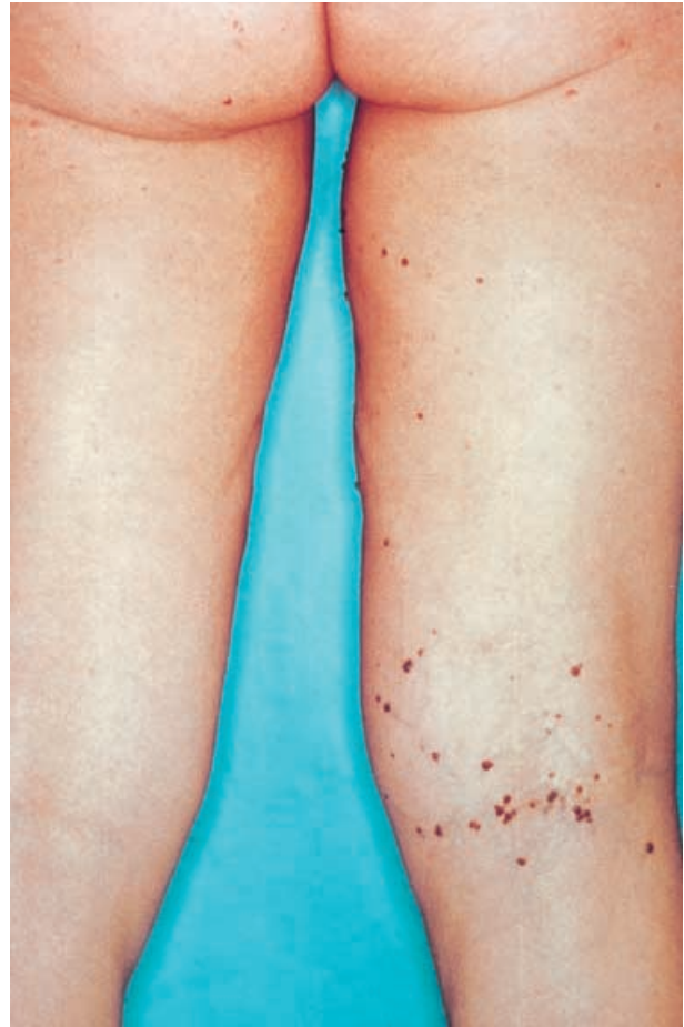
Figure 1. Angiokeratoma corporis diffusum affecting the right leg.

Lysosomal enzyme assays were performed in cultured fibroblasts and leucocytes from the patient. Fibroblast cultures obtained from unaffected skin were