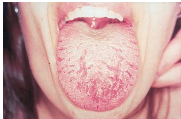
Figure 2. Macroglossia with a scrotal appearance.

established in Ham's F-10 medium according to routine procedures. Leucocytes were isolated according to Skoog and Beck. 7 AGA activity was assayed with 1.5 mmol L -1 L-aspartic acid- \beta -7-amido-methylcoum-