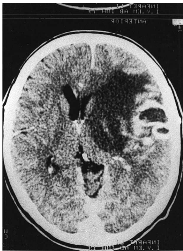
Fig. 2 CT scans obtained 2 months after the initial event showing marked mass effect and ring enhancement consistent with abscess formation. (The figure is mirrored because of the different CT scan orientation.)