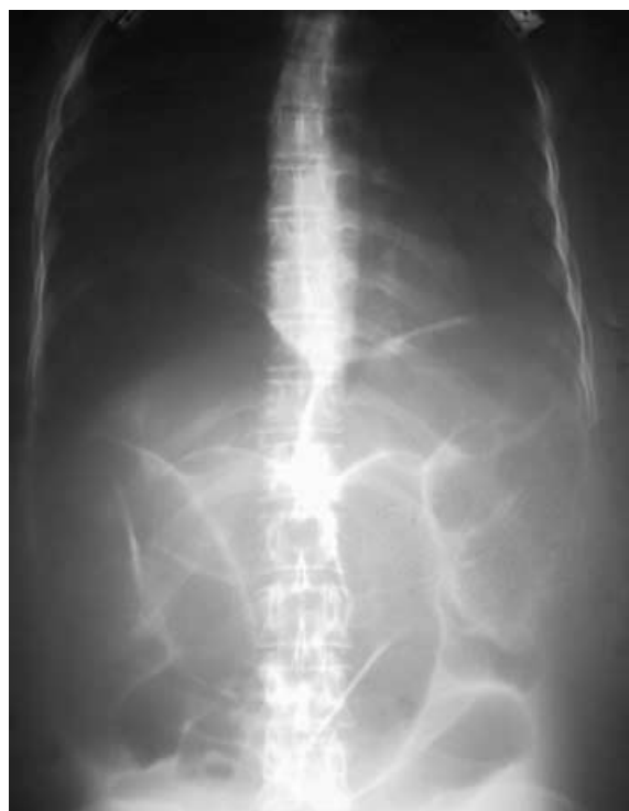
Fig. 1 Simple abdominal radiograph of the proband's intestinal pseudo-obstruction.

Serum lactate was 4.1 \text{ mmol L}^{-1} (normal <2.09 \text{ mmol L}^{-1} ), pyruvate was 0.3 \text{ mmol L}^{-1} (normal <0.03 \text{ mmol L}^{-1} ), and blood muscle enzymes were also elevated. A cranial magnetic resonance (MR) confirmed the lesions already visualized in CT and revealed changes on signal intensity