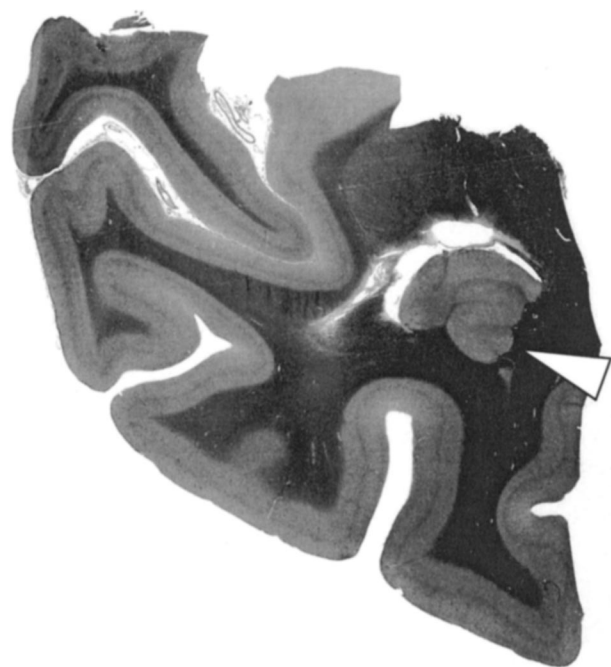
FIG. 1. Occipitomedial right with nodular mass of ectopic grey substance (white arrowhead) bulging into the ventricular lumen (Elastica-van-Gieson).

Macroscopically, signs of marked brain edema with flattened gyri, compression of the ventricular system, and prominent temporal and tonsillar herniation were seen. Around the occipital horns of the lateral ventricles, nodules of gray matter were seen bilaterally, bulging into