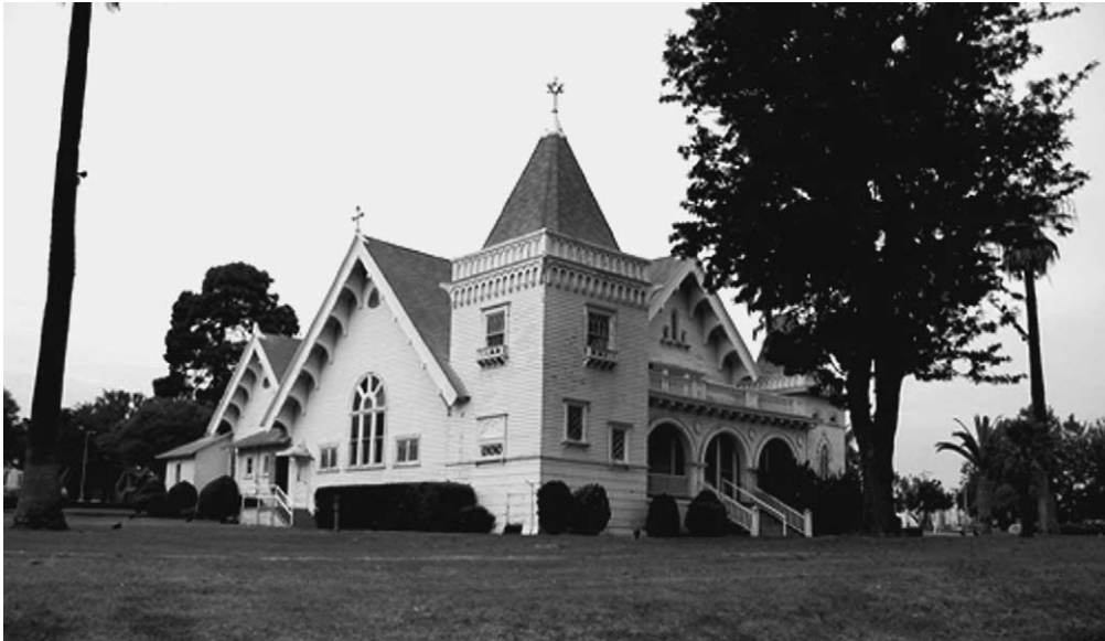
Fig. 2. Key landmark along route. Major chapel scene along route to hospital (picture was shown in color to the patient).

landmarks or scenes, he was then asked to indicate the direction he would take along the route. Missed landmarks or scenes were cued by providing the street names. Finally, two photographs of missed scenes varying in angle of photographic orientation, were presented, along with an equal number of distractors, for matching.