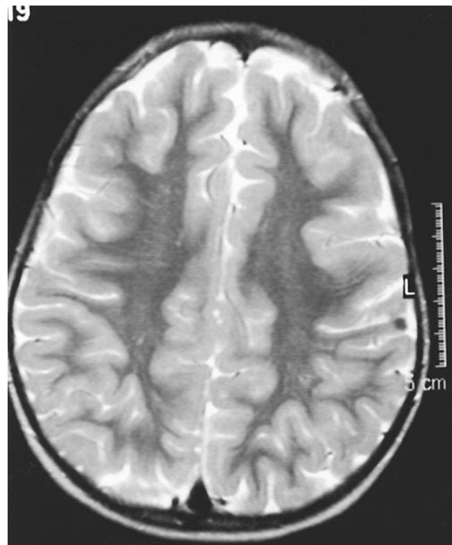
Figure 3. Axial T 2 -weighted image 9 months after presentation. The white-matter edema has resolved, but the discrete, hypointense, rounded lesion is still visible.

Neurocysticercosis is the most common parasitic infection of the central nervous system. It is caused by Taenia solium , the pig tapeworm. When humans accidentally ingest the eggs of T solium in fecally contaminated water or food the eggs hatch, larvae enter the circulation and finally encyst (as cysticerci) in muscle and within the central nervous system; hence, neurocysticercosis may ensue. 3 By contrast, ingestion of undercooked pork containing cysticerci results in intestinal colonization by the tapeworm rather than neurocysticercosis, which occurs only if there is subsequent autoinfection by ingestion of food contaminated by the patient's own feces. 3 It has a mean incubation period of 4.8 years and is therefore infrequent in young children. 1,2 The most common presentation in children is with focal seizures in association with single parenchymal lesions. Other presentations include generalized seizures, focal neurologic deficit, and symptoms of raised intracranial pressure. 2 Diagnostic criteria for neurocysticercosis have been proposed and are divided into epidemiologic (individuals from endemic areas), minor (intracranial calcification, clinical features of neurocysticercosis, disappearance of cystic intracranial lesions after anticysticercal therapy), major (lesion suggestive of neurocysticercosis on cranial imaging and positive serology), and absolute