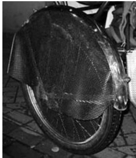
Figure 3 Protected spokes on the wheel of a modern recreational rickshaw.

Secondly, of note was the impossibility of tracheal intubation in this patient even with the assistance of