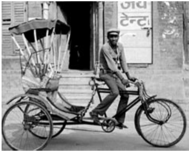
Figure 2 Cycle powered rickshaw.

survivors. 2,3 Aggarwal from the Department of Forensic Medicine at Delhi has described a number of common features including the persistence of unconsciousness from the outset with death confirmed soon after arrival at hospital.