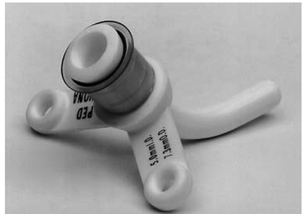
Figure 2 Bivona tracheostomy tube with the plastic flange replaced upside down, making connection to the breathing system impossible.