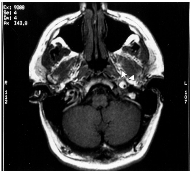
Fig. 1. T1-weighted magnetic resonance imaging scan showing an abnormal flow pattern consistent with dissection of the left internal carotid artery (arrow).