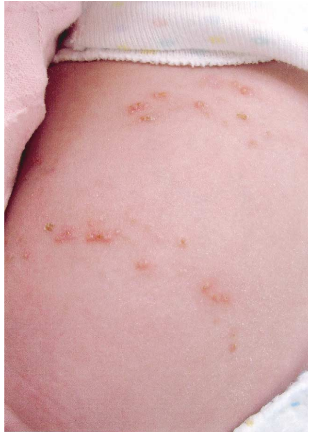
Figure 1. Typical early dermatologic findings with vesicles were identified soon after birth.

Fiorillo L, Sinclair DB, O'Byrne ML, Krol AL. Bilateral cerebrovascular accidents in incontinentia pigmenti. Pediatr Neurol 2003;29:66-68.