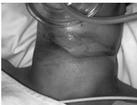
Figure 1 Neck laceration caused by accidental strangulation with a horse rope.

A 37 year old woman who had bred horses for more than 20 years was leading two horses simultaneously by their leading ropes in a horse corral. One horse bolted, and the lead rope briefly wrapped around her neck and was suddenly released. The patient recalled that she had stepped on the end of one of the two ropes. She complained of severe neck pain, difficulty in breathing, left arm weakness, and paraesthesia of both hands and feet. She drove her car to a local general practitioner who gave her 100 mg hydrocortisone intravenously and referred her to a local district hospital. Examination showed an anxious patient with a deep transverse painful laceration of a rhomboid shape on the anterior neck. There was superficial skin loss with severe surrounding oedema (fig 1). There was loss of muscle power but normal sensation in the left upper limb. Sensory and motor function were normal in the lower limbs. The patient was given morphine analgesia, had cervical spine immobilisation, and was transferred to Royal Perth Hospital.