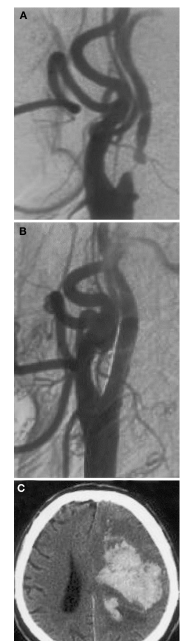
FIGURE 2. Patient 3. A and B, lateral projections of left common carotid artery injections. A, angiogram, showing severe left internal carotid artery stenosis, with the string sign. B, angiogram, showing the left internal carotid artery after angioplasty and stenting. C, brain CT scan, demonstrating left hemispheric intracerebral hemorrhage, a midline shift, and hydrocephalus.

The pathophysiological mechanism of cerebral hyperperfusion syndrome remains unclear. Traditional teaching has been that hyperperfusion syndrome is attributable to the failure of normal cerebral autoregulation, secondary to long-standing changes in perfusion pressure. Maximal dilation of cerebral arterioles for long periods of time causes loss of cerebral blood flow autoregulation in areas of chronically underperfused brain tissue and can result in hemorrhage and/or edema. The absence of evidence of infarction on acute diffusionweighted MRI scans and the absence of evidence of arterial occlusion argue against the hypothesis that hyperperfusion syndrome is simply a manifestation of postoperative thromboembolic stroke. Hem-