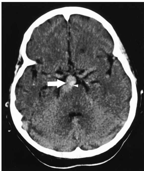
Fig. 1. Native CT scan showing an extremely dilated basilar artery (white arrow) with a small thrombus (white arrowhead) in the tip of the basilar artery.

complete opening of the mouth was possible. There were anarthria and severe dysphagia. She had soft palate paresis, and brisk gag reflexes. Masseter reflex was also very brisk. It was flaccid tetraplegia with bilateral Babinski signs and