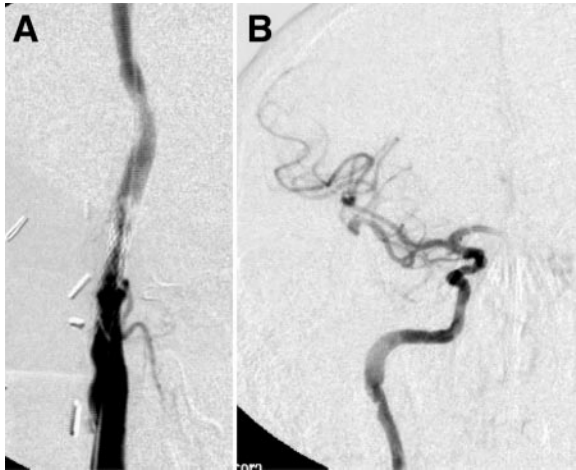
Figure 2 ♦ (A) The filling defects within the ICA stent indicate the presence of acute thrombus. (B) Intracranial angiography demonstrated sluggish flow, multiple filling defects, and very minimal opacification of the anterior cerebral artery.

responsive, hypotensive, and experienced generalized seizures followed by hemiparesis. He was immediately intubated and resuscitated with intravenous fluid, and a dopamine infusion ( 5 \mu\text{g}/\text{kg}/\text{min} ) was begun. Bedside duplex ultrasonography of the right ICA revealed in-stent thrombosis with minimal