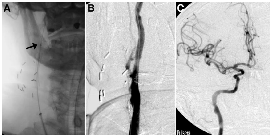
Figure 3 ♦ (A) Distal marker (arrow) indicates the tip of the AngioJet catheter within the ICA beyond the stent. (B) Angiography after mechanical thrombectomy of the ICA stent, with complete thrombus resolution. (C) Complete and brisk filling of both the middle and anterior cerebral arteries after percutaneous mechanical thrombectomy and abciximab bolus.

flow beyond the stent. The patient was taken back to the operating room, where the right common femoral artery was cannulated, and a 6-F introducer sheath (Boston Scientific/Medi-tech) was placed. Carotid angiography (Fig. 2A) showed in-stent nonoccluding thrombus and slow contrast transit within the stent, distal right ICA, and cerebral circulation (Fig. 2B). Percutaneous mechanical thrombectomy (AngioJet Rheolytic Thrombectomy System; Possis Medical Inc., Minneapolis, MN, USA) was performed with a 0.018-inch system (Fig. 3A). Intravenous abciximab (Reopro; Eli Lilly, Indianapolis, IN, USA) was begun during the procedure ( 0.25 \text{ mg}/\text{kg} bolus over 20 minutes), and the patient was given another bolus of heparin ( 100 \text{ U}/\text{kg} ) prior to thrombectomy. Postprocedure angiography (Fig. 3B) revealed brisk flow through the carotid artery stent, distal ICA, and cerebral circulation (Fig. 3C). The groin sheath was removed, and a Closer device was used to achieve groin hemostasis. The patient was transferred to the intensive care unit, where he was extubated at 2 hours. Physical examination at that time revealed grossly intact neurological function except for a mild left arm weakness. Abciximab infusion ( 0.125 \mu\text{g}/