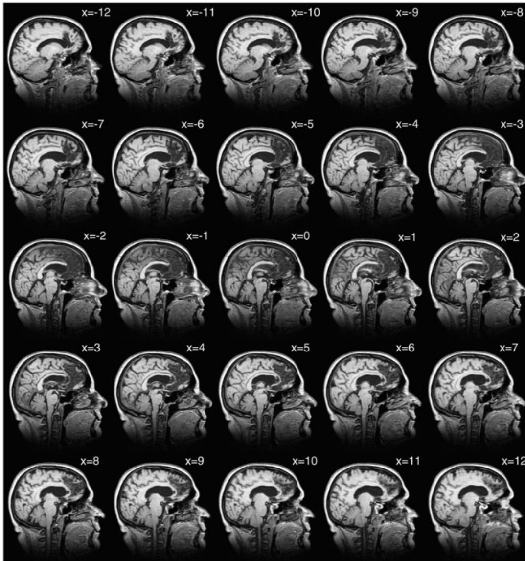
Fig. 1 1 mm Sagittal sections through GT's brain, extending 12 mm left (x values are negative) to 12 mm right (x values positive) of the midline, demonstrating extensive cortical damage in both hemispheres and, generally, greater sub-cortical involvement in the right hemisphere.

sections extending from 12 mm left of the midline to 12 mm right of the midline are shown in Fig. 1.