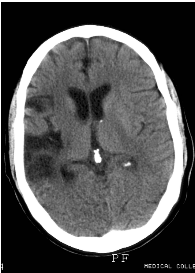
Fig. 1. CT of brain indicating right middle cerebral artery infarct.

PD indicated a strong right-hand preference for practice tasks. A task of gross motor strength indicated grip