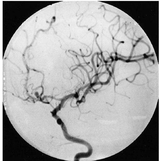
Fig. 3 Cerebral angiography showing ACom artery aneurysm and radiological evidence of vasospasm

A left pterional craniotomy was performed. After splitting the Sylvian fissure the gyrus rectus was sucked out, and a large aneurysm was identified arising from the ACom artery. A small pediatric curved clip, supported by a straight Yasargil clip, was used to secure the aneurysm. The postoperative course was uneventful and the baby was discharged without neurological deficits.