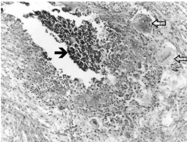
FIG. 2. Photomicrograph of subcutaneous tissue showing focal necrosis (solid arrow) with neutrophils bordered by histiocytes admixed with Touton giant cells (open arrows). H & E, original magnification \times 90 .

The tumor was yellowish, lobulated, firm, avascular, and attached to the dura mater. There was a good interface between the tumor and brain, and the lesion was totally excised.