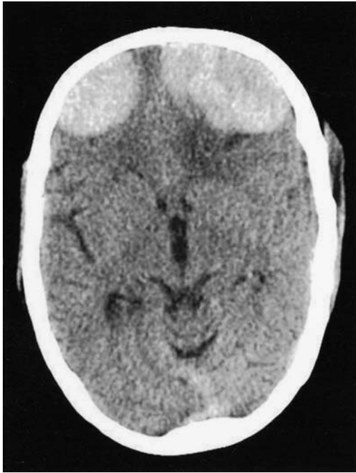
FIG. 1. Contrast-enhanced axial CT scan of the brain revealing a well-defined, homogeneously contrast enhancing, dura-based lesion located in the bilateral frontobasal region.

and posterior axillary folds had decreased by 20 to 30%. It was at this time that he experienced the seizures. The CT scan revealed a large bifrontal mass lesion and, therefore, the patient underwent a bifrontal craniotomy and total excision of the lesions.