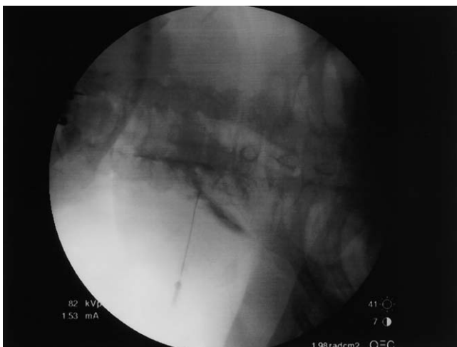
Fig. 3. Typical contrast pattern for right selective C5–C6 transforaminal block.

nervous system toxicity, it follows that sedation should be kept to a minimum.